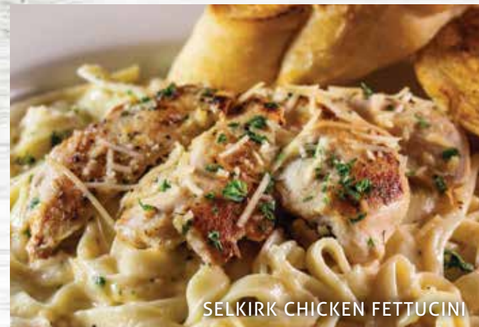
SELKIRK CHICKEN FETTUCCINI

Fettuccine noodles tossed in our house-made alfredo sauce topped with chicken. Served with Parmesan and garlic toast.