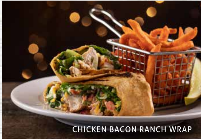
CHICKEN BACON RANCH WRAP