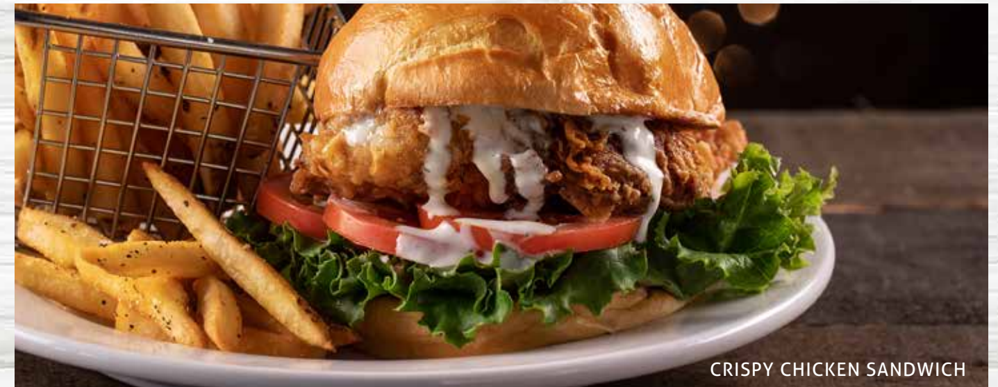
CRISPY CHICKEN SANDWICH

SERVED WITH CHOICE OF FRIES, SWEET POTATO FRIES, SALAD OR SOUP. ONION RINGS FOR $1.50